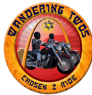
St. Louis, MI