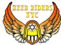
New York, NY