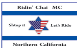
San Francisco, CA