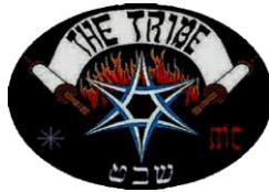
Johannesburg, South Africa