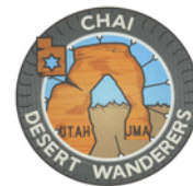
Salt Lake City, UT

To contact the JMA please go to www.jewishbikersworldwide.com