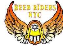
New York, NY