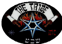
Johannesburg, South Africa