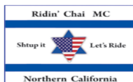
San Francisco, CA