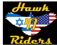
Iowa City, IA