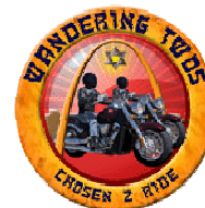
St. Louis, MI

To contact the JMA please go to www.jewishbikersworldwide.com